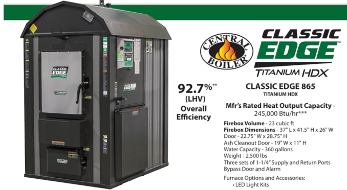
The Classic Edge Titanium 865 HDX model is U.S. EPA Step 2 Certified